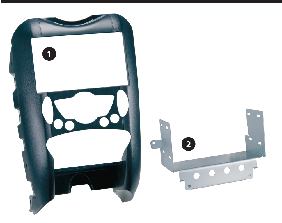
Double DIN Kit contents • (1) Center console • (2) Mounting Bracket

All installation work must be performed by a qualified professional installer only. The manufacturer / dealer is not liable for any kind of incidential or indirect damages.